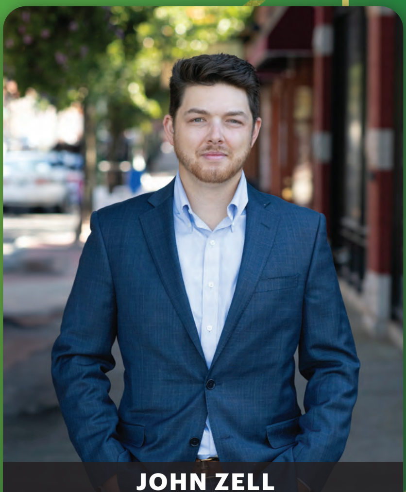
CHIEF OPERATING OFFICER